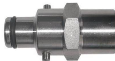
5/8" BSPF Pin Valve Adaptor NSW/ACT