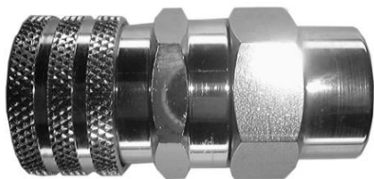
5/8" BSP Snaplok Adaptor SA/NT/WA/VIC/TAS/QLD