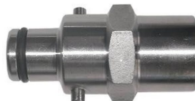
5/8" BSPF Pin Valve Adaptor NSW - ACT